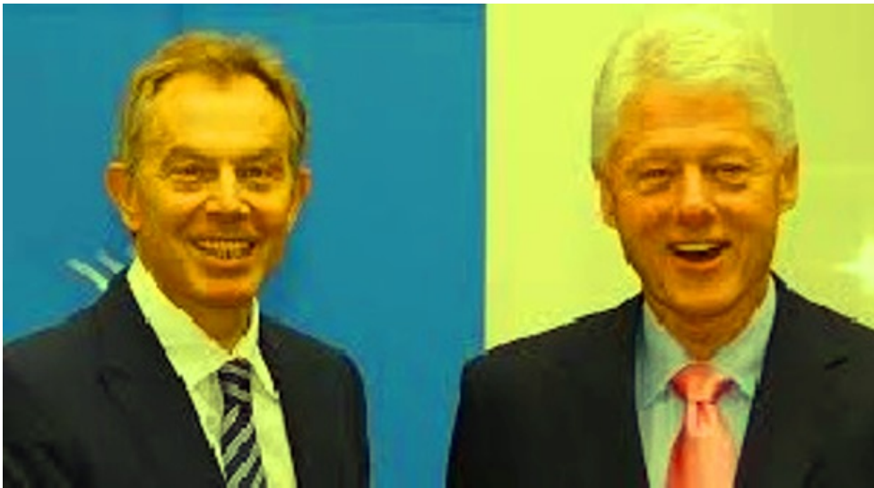
Fig : ( R to L ) Bill Clinton & Tony Blair

The above are indeed mind-boggling scientific discoveries and can only occur in a society where intellectual activity and the quest for truth are untrammelled. To be able to decode over 3.1 billion subunits of DNA, the chemical letters (called Acronyms) that make up the recipe of human life, is no mean achievement. There are many more scientific and technological wonders undreamed and unimagined of during the age of the erstwhile European Renaissance but currently happening in our 21 st century world. At the same time, successful scientific marvels benefit the social and political morale of the mankind reducing dependency on godly favors and themes from God's expertise and His Divine Knowledge-dom (HDK). But, mankind has experienced setbacks too in potential scientific failures, such as for example, the failure of creation of Human Life-giving Dynamic Force (HLDF) in laboratory and failure to prove the reason as to why there are not one Universe in existence like the present known one to the mankind but several other Universes beyond galaxies . Therefore, as a way forward, Scientists find recourse in the systems of Divinity and are reverting to studying and relying on the Vedic Manuscripts of Hinduism in regard to obtaining clues to