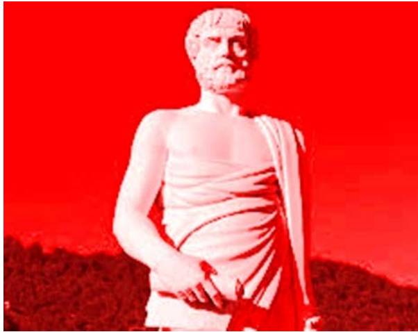
Fig. Aristotle (384-322 BC)

Metaphysics is the branch of philosophy concerned with the nature of existence, being and the world. Arguably, metaphysics is the foundation of philosophy. Aristotle calls it “first philosophy” or just wisdom and says it is the subject that deals with first causes and the principles of things. This is called “ An Aristotelian Approach ”.