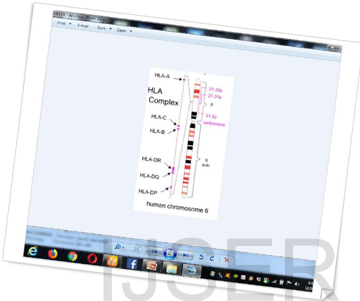
Fig. The HLA Complex Context Diagram